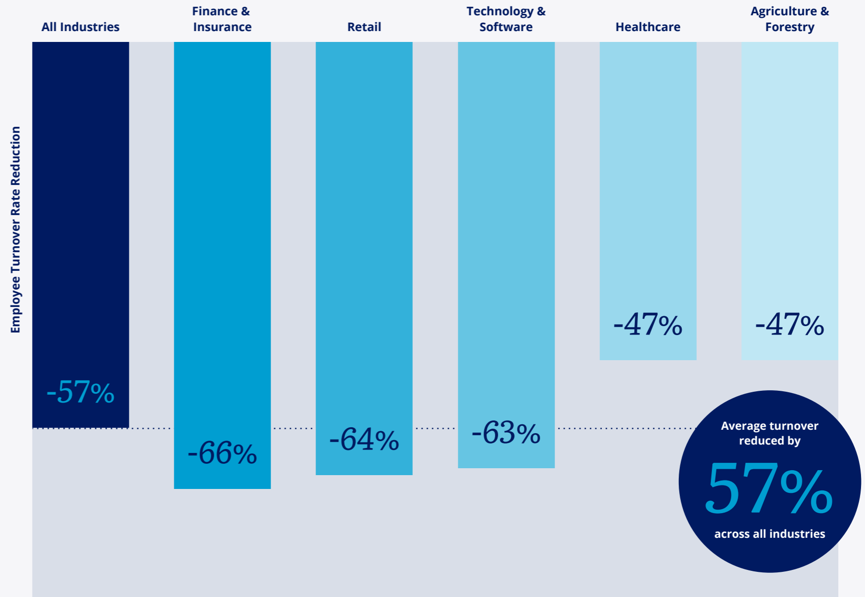
Top 5 industries that saw the greatest reduction in turnover between employees who donated and volunteered and those who did neither